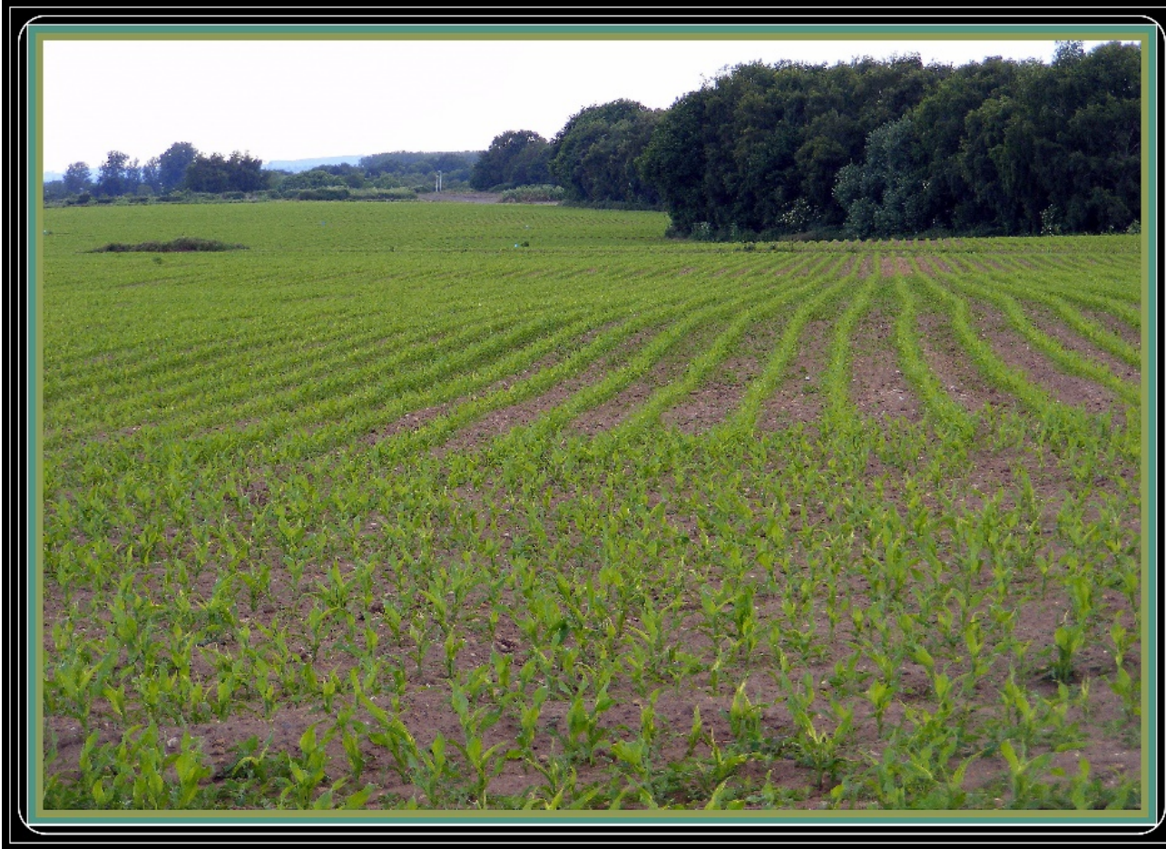
Valuable crop of maize on Three Farm Meadows Ockham June 2022 under threat of becoming a huge housing estate