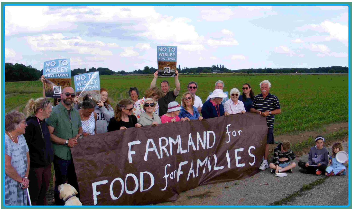
Three generations of families are concerned about where the meals of the future will come from if Three Farm Meadows goes under concrete and come together with VILLAGES AGAINST WISLEY NEW TOWN to object to this threat on a huge green field site adjoining former Wisley airfield