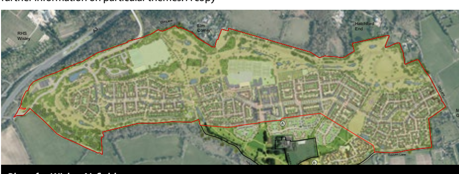
Plans for Wisley Airfield

Closing date for nominations is 31 October and the winner will be invited to receive their accolade at the Chairman's Thank You Party on 13 December at Horsley Towers.