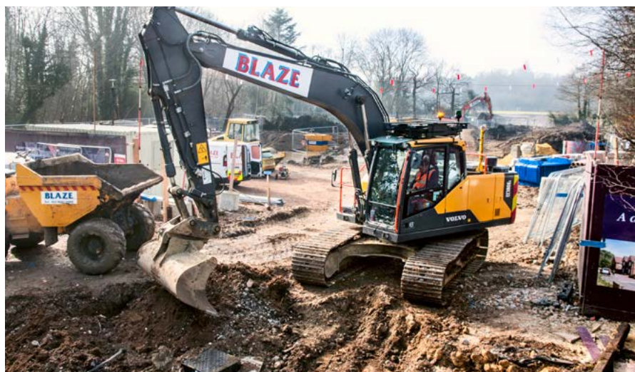
Work starts at Lollesworth Fields – now renamed Ada Gardens