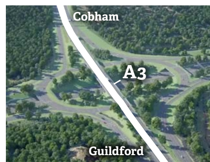
M25, junction 10 improvement scheme

In recent weeks there has been some improvement, and the Government's threat of putting GBC Planning into special measures will no doubt help concentrate minds in the department.