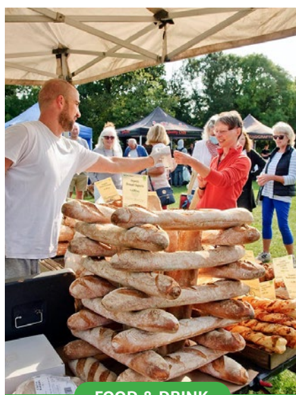
FOOD & DRINK