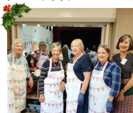
Silver Sunday helpers from East Horsley WI

A big thank you to all the local residents, volunteers and sponsors. Plans are already being hatched for an even bigger and better event in October 2024.